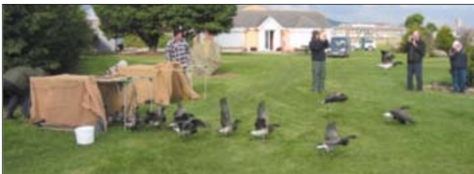
Release of geese after catch at Dungarvan.

The increase in the ringed population has also drawn records away from Ireland and Iceland. 'CIWW', ringed in October at Strangford Lough, was recorded passing through Normandy on its way down to the Isle of Oleron on the southwest coast of France. 'XXYY' passed through Strangford Lough, and then was seen on the Dee