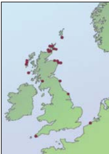
Localities in northwest Europe where colour-ringed Purple Sandpipers, marked in Iceland in May 2003 and 2005, have been seen. We need to know more about Ireland.

The ringing team are keen to get records from the next few 'winters' and have asked us to encourage bird-watchers interested in waders to check Purple Sandpiper flocks they encounter during the course of I-WeBS core counts or NEWS surveys this winter (see page 3 of newsletter).