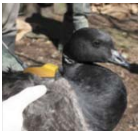
'Douglas', caught in Tralee Bay on 3rd April 2006' (Kendrew Colhoun).

Autumn and mid-winter counts were also carried out in mid-October and mid-January respectively. Iceland was surveyed in mid-October and data was received from both Jersey and France in January.