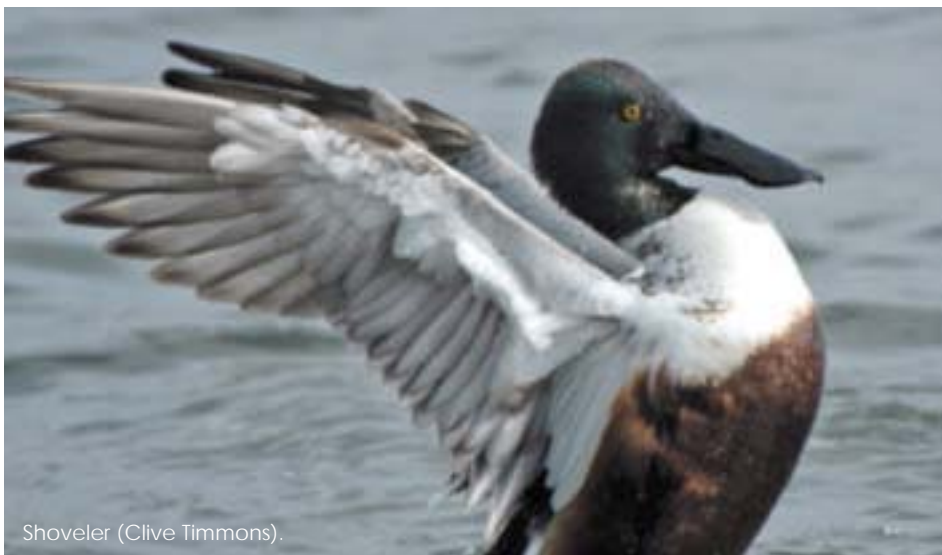
Shoveler (Clive Timmons).