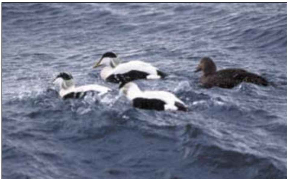
Common Eider.