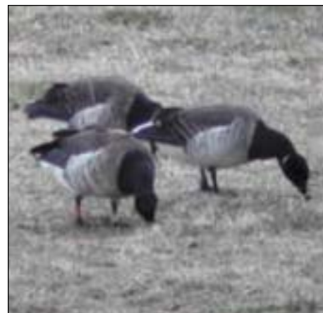
'Douglas', the same bird, pictured again one month later in south west Iceland. Douglas is currently (end July 2006) on Ellesmere Island in Arctic Canada!.