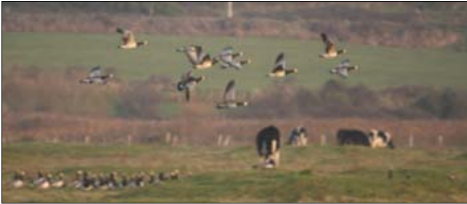
Barnacle Geese at Lissadell, Sligo (Dick Coombes).

Nestled between the distinctive limestone plateau of Benbulbin, and Knocknarea where Queen Maebh's Grave is located, and the rustic, granite Ox Mountains lie the three estuaries which constitute Sligo Bay. Ensnared in the middle bay is the original "Coney Island". Each bay has its own particular character and dynamic. There is some movement of birds between all three bays, given their close proximities, but the degree of flux appears to be small.